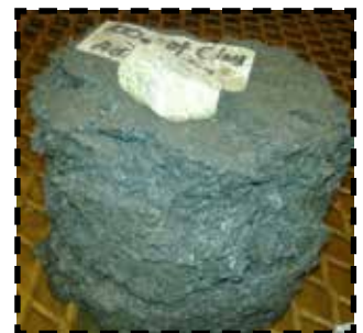
After: 8 hour test in H2O