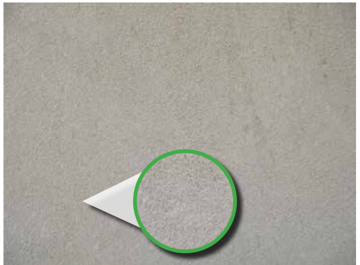
Plaster with Fibre Plast