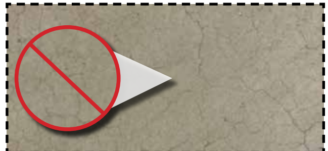
Common Dry shrinkage Cracks in concrete can be avoided - 12mm Fibre Con can be used for Garage, Showroom, Factory floors or any exposed concrete beams.