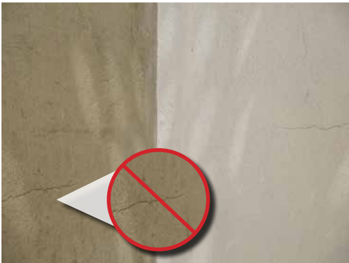
Plaster without Fibre Plast