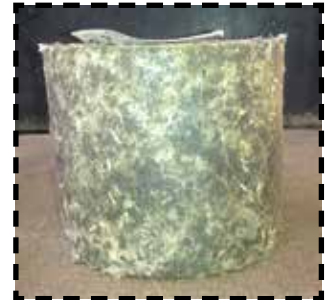
Before: 100% Clay + FPC